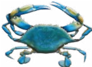
11147-T# Crab 7.25 x 7.25