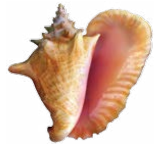
11140-T# Conch 7.25 x 7.25