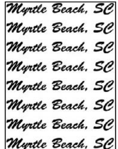
Text Layout #7 8 Transfers - Max 10.5" x 1.25"