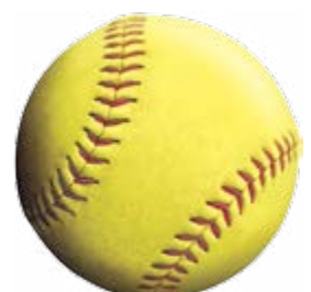
11170-T# Fast Pitch Ball 7.25 x 7.25