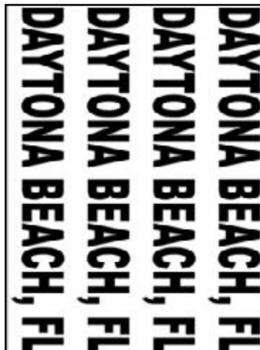
Text Layout #9 4 Transfers - Max 14.5" x 2.25"