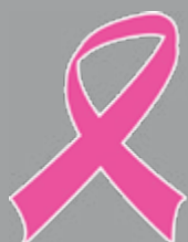
Ribbon Crest 15064E9