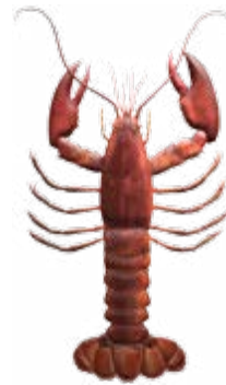
11142-T# Lobster 10.5 x 9.5