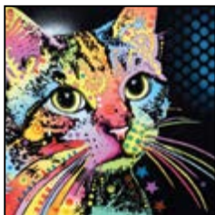
5" x 5"