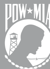
POW Crest 21440E9