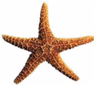
11039-T# Starfish 7.25 x 7.25