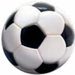
© artbrands.com 11169-T# 3D Soccer Ball 7.25 x 7.25