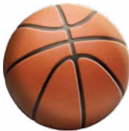
© artbrands.com 11167-T# 3D Basketball 7.25 x 7.25