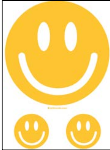
Image Layout #2 1 Transfer - Max 10.5" x 10.5" 2 - Transfers - Max 3.5" x 5"