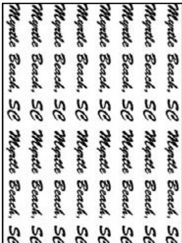
Text Layout #8 16 Transfers - Max 7" x .875"