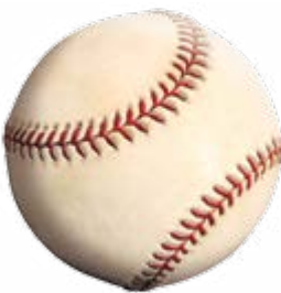
11165-T# 3D Baseball 7.25 x 7.25