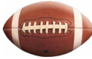
11168-T# 3D Football 7.25 x 7.25