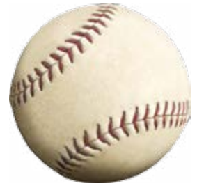
© artbrands.com 11171-T# 3D Softball 7.25 x 7.25