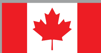
Canadian Flag 21438E9