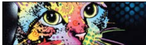
10" x 3"