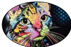
6" x 4"