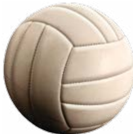
© artbrands.com 11166-T# 3D Volleyball 7.25 x 7.25