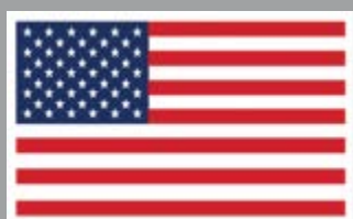
American Flag 20746E9

Great small designs to add to your t-shirts, bags, and more! Only $20 for 50 pieces!