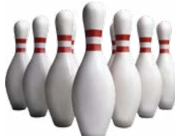
© artbrands.com 11179-T# 3D Bowling Pins 7.25 x 7.25